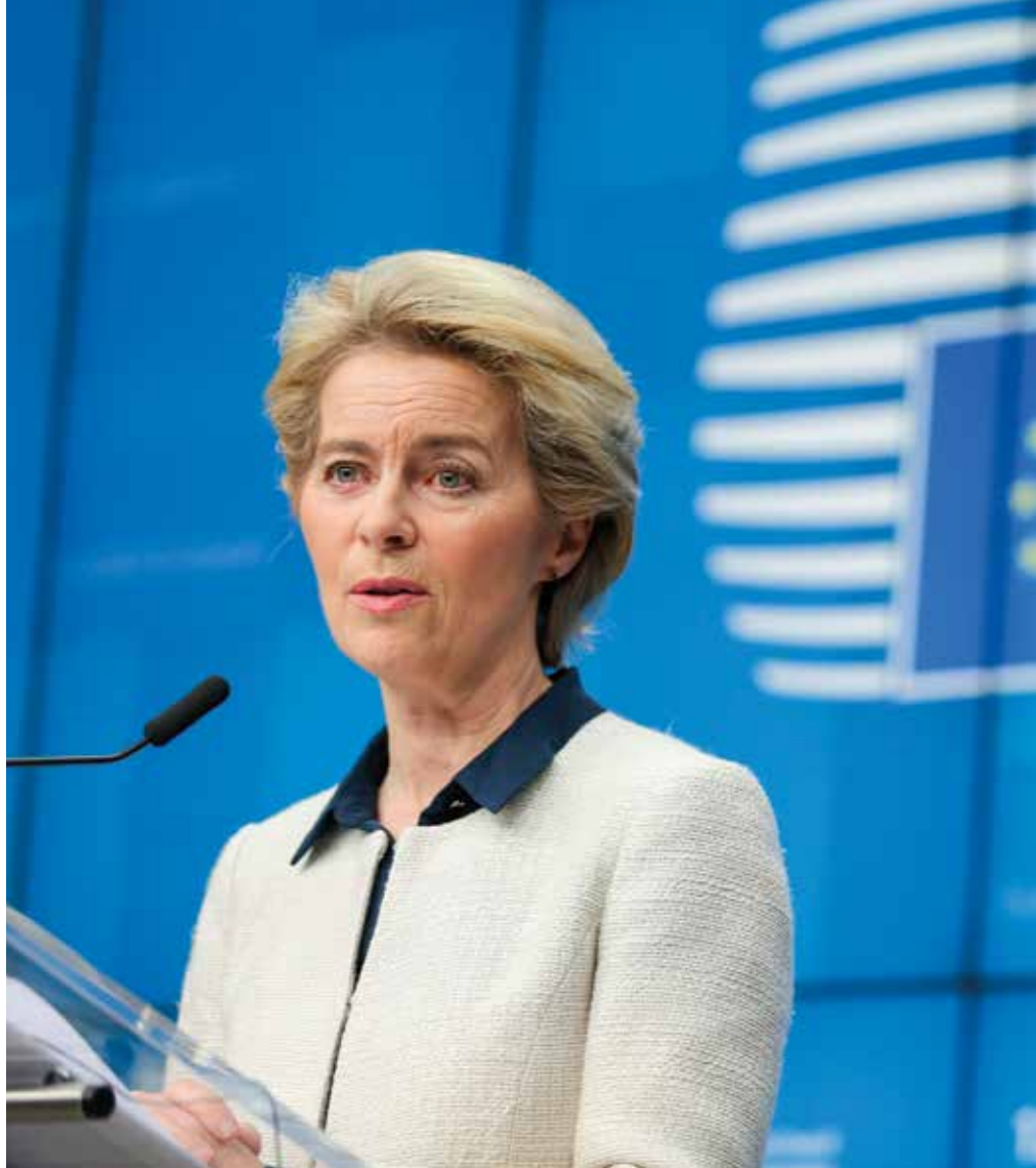
Ursula von der Leyen, the president of the European Commission

We can see this happening in the AI space as well. Microsoft made its biggest investment ever in January 2023, with US$10 billion in OpenAI. Amazon and Google committed to invest US$4 billion and US$2 billion, respectively, in Anthropic, OpenAI's competitor. These same companies—Microsoft, Amazon, and Google—are massively scaling up their cloud infrastructures to execute their AI workloads, 29 and are also investing in custom AI chips to keep up with expected demand. 30 There is little doubt that these huge investments will