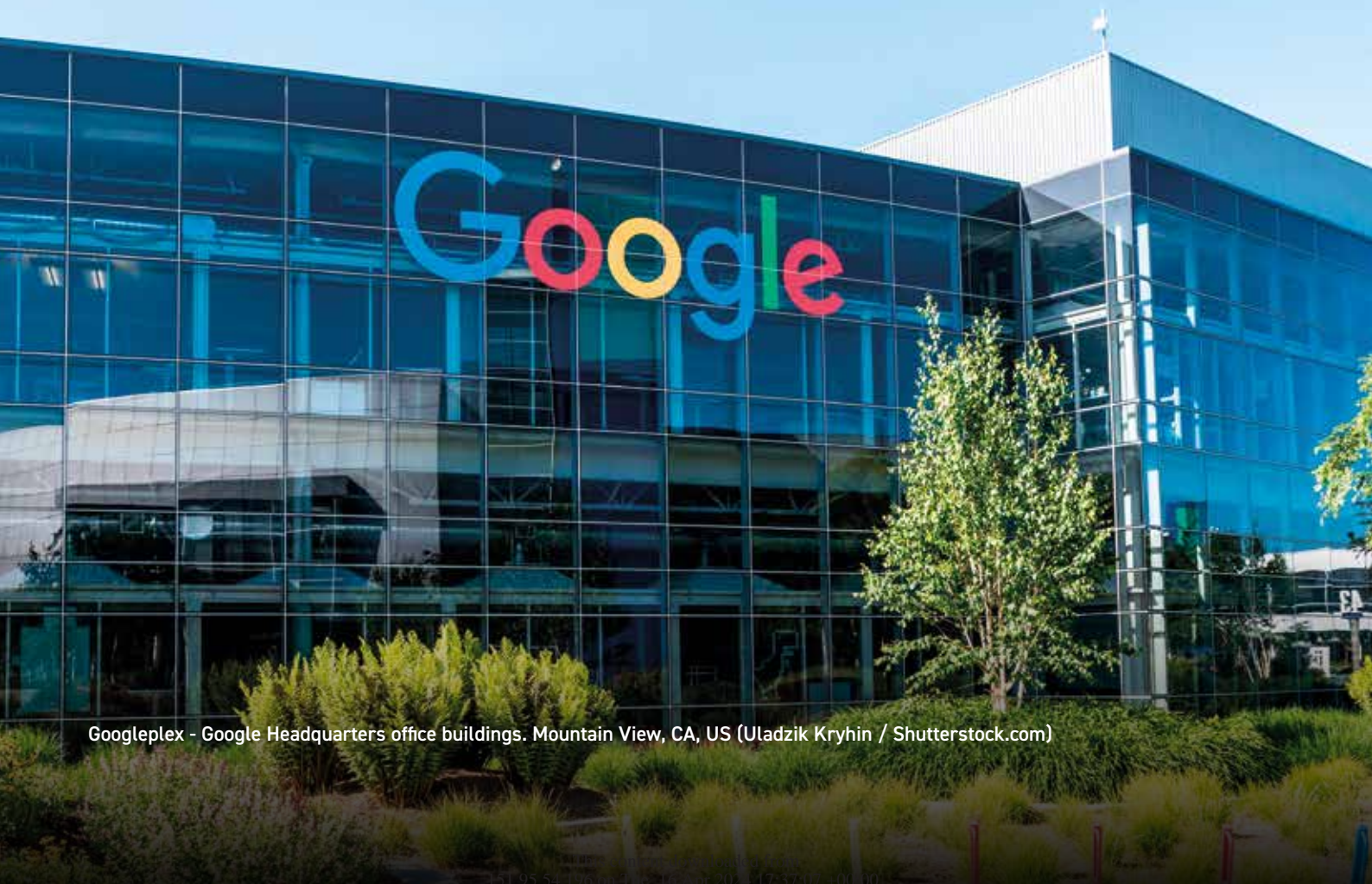
Googleplex - Google Headquarters office buildings. Mountain View, CA, US

By now most companies and governments use the cloud infrastructure of three dominant U.S. providers—Amazon, Microsoft, and Google. Realization has set in that the widespread reliance on these “big tech” companies could pose a threat to the digital sovereignty of the European Union (EU) and its member states. At a time when cyberattacks are part and parcel of warfare and ever-increasing cyber-crime, cyber resilience has become a cornerstone of our national security, for which we largely depend upon on a few dominant commercial players, even in times of war. The complexity of their cloud-based infrastructure is such that very few European enterprises and public services still ‘have’ the expertise and means to protect themselves, the rest of them ‘have not’. This is creating huge social, economic, and geographic disparities. Generative AI systems (like ChatGPT), which are bolted onto their existing products (like Microsoft 365 Copilot), are already significantly accelerating this dependence. EU policy initiatives to curb the market powers of big tech seem to be having little effect on diminishing this reliance.