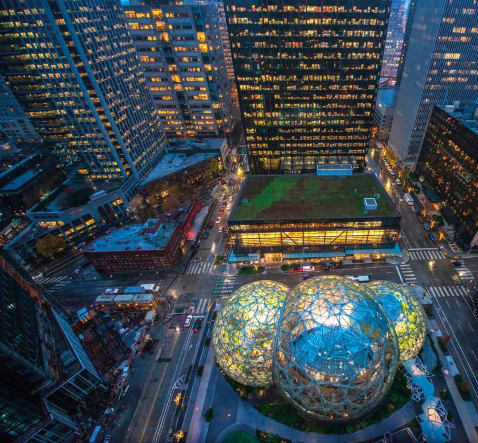
Aerial view of the ‘Amazon Spheres’ at the tech company’s headquarters in downtown Seattle, USA

tection, sandboxing email attachments, enforcement of DMARC (Domain-based Message Authentication, Reporting and Conformance) and strong TLS (Transport Layer Security) protocols, data provenance, and governance enforcement, etc. Furthermore, the main cloud providers have a very extensive visibility (‘telemetry’) on the adversary infrastructure and modus operandi, allowing them to block communications to dangerous places or to trigger detection alerts. Some of this telemetry is already deployed in browsers, 31 leaked