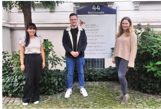
The Incoming Coordinators

As a student, you automatically get a semester ticket, which allows you to use all local buses and trains throughout Hesse and Mainz for free. You can reach all near-by cities at no cost. This is a great opportunity to discover Germany!