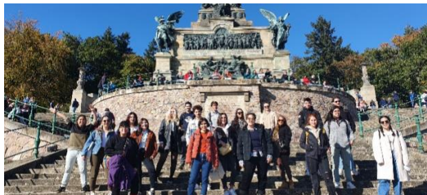
Activity: Trip to Rüdesheim

At the WBS, three coordinators plan activities for you every week. Many of the activities are heavily reduced in price, thanks to different financial funding from our university. These include laser tag and wine tours, just to name a few. During the pandemic we offer online museum tours and an online adventure in an escape room for you! We will greatly expand our on-site visits when the pandemic is over. Moreover, as the first weeks in a new environment can be challenging, the Wiesbaden Business School has set up a "Buddy - Program", which assigns every exchange student a German student who serves as a personal contact during your entire stay.