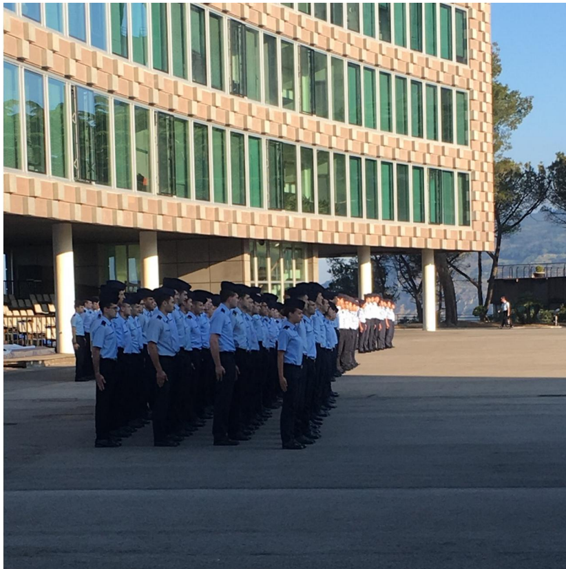
Flag-raising ceremony at 7:10 am

In conclusion, it was an incredibly enriching experience, which made us mindful of a different lifestyle, completely unknown to us before.