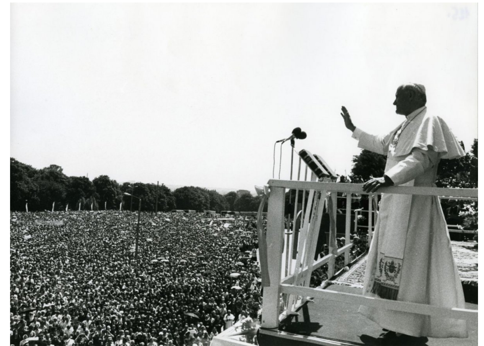
John Paul II in Poland in 1979