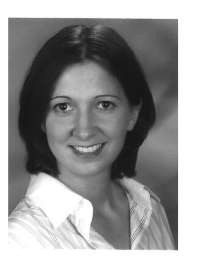
International Co-ordinator OUTGOING Students