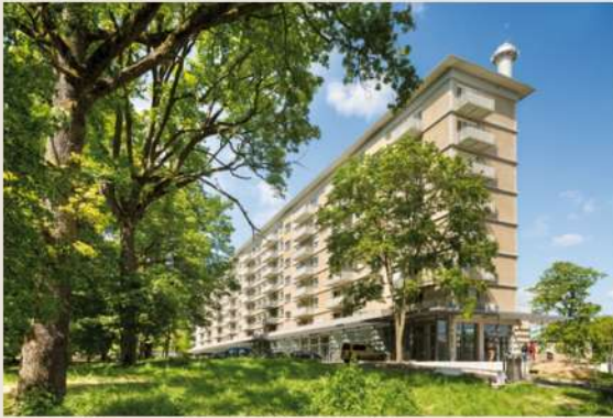
Résidence étudiante Marcel Lods