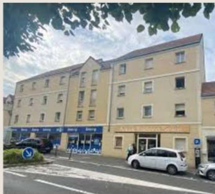
Résidence étudiante Armade