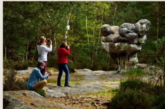
Forest and hiking