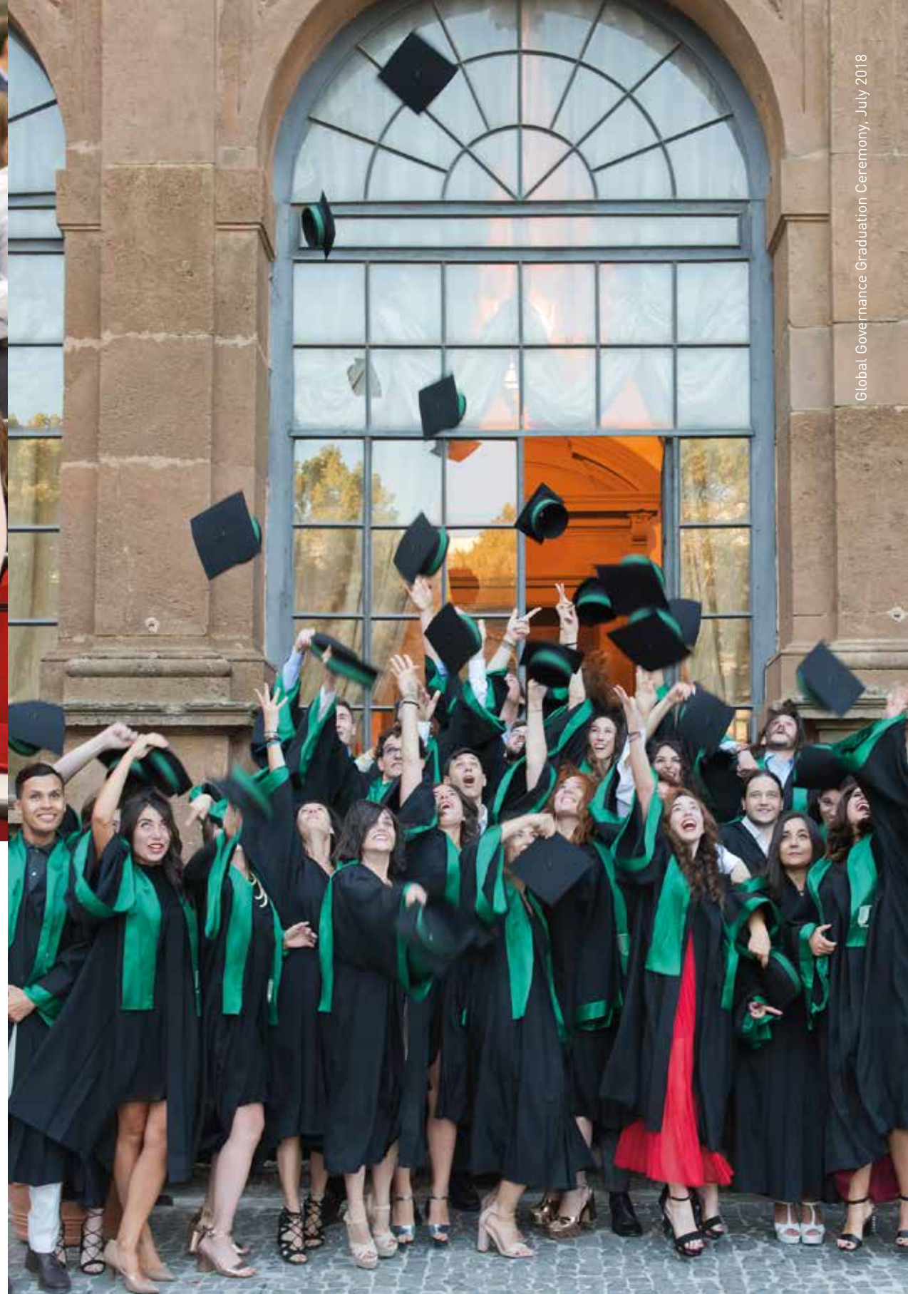
Global Governance Graduation Ceremony, July 2018