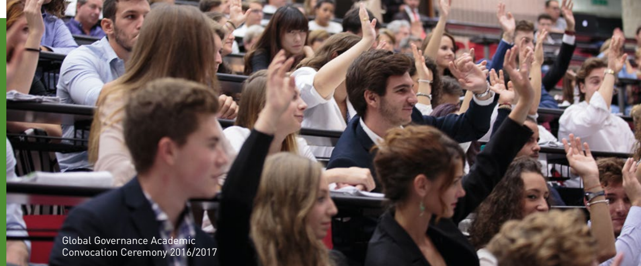
Global Governance Academic Convocation Ceremony 2016/2017

During the academic year, Faculty members and students attend conferences, seminars and workshops where a wide range of topics relating to global governance are discussed.