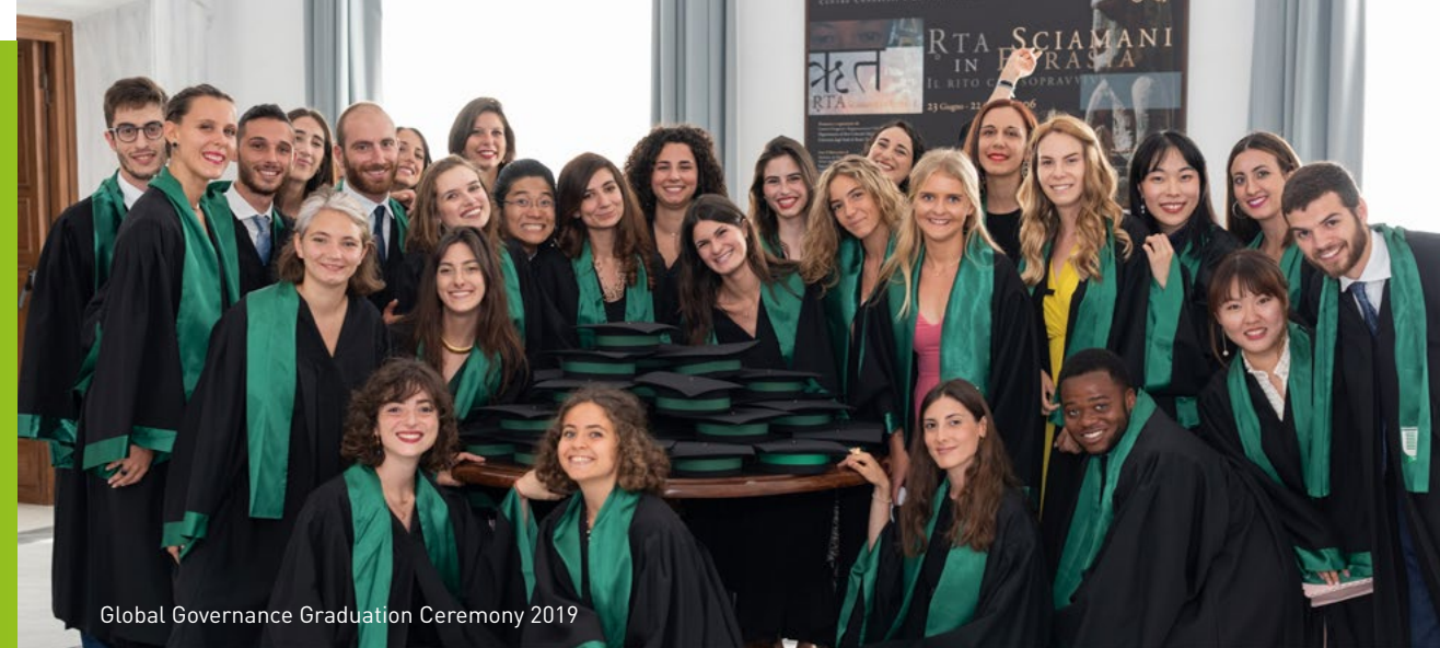
Global Governance Graduation Ceremony 2019

world politics, deepening their knowledge of Russian and French institutions and culture, and getting prepared for careers in government and policymaking, international business and non-governmental organizations. Upon graduation, they will receive diplomas from both institutions.