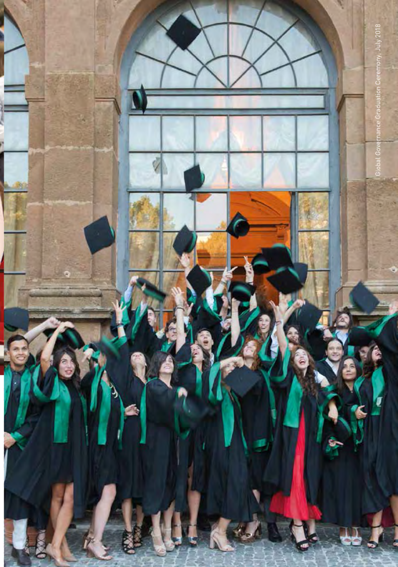
Global Governance Graduation Ceremony, July 2018