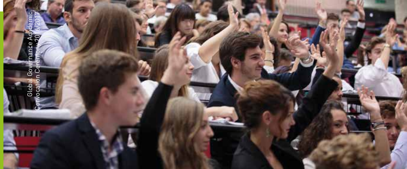
Global Governance Academic Convocation Ceremony, 2016/2017

Upon graduation, they will receive diplomas from both institutions. The programme's curriculum includes: Russian language, political science, public policy studies, international relations and project management, combining theoretical knowledge with real-life approaches to political issues focusing on two 'geopolitical' tracks: 1. Northern Europe in the European Union; 2. BRICS and Russian Studies.