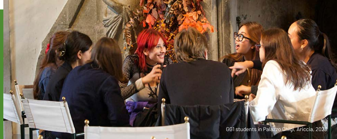
GG1 students in Palazzo Chigi, Ariccia, 2023

During the academic year, Faculty members and students attend conferences, seminars and workshops where a wide range of topics relating to global governance are discussed.