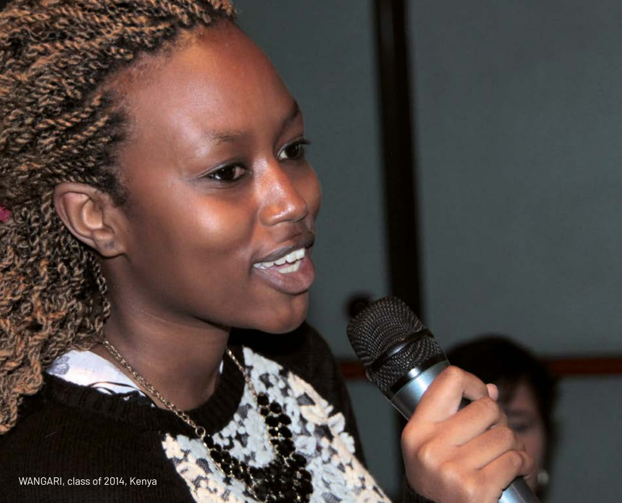
WANGARI, class of 2014, Kenya