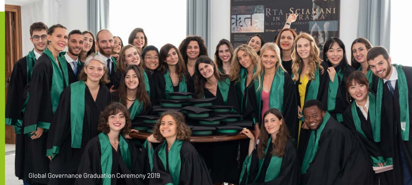
Global Governance Graduation Ceremony 2019