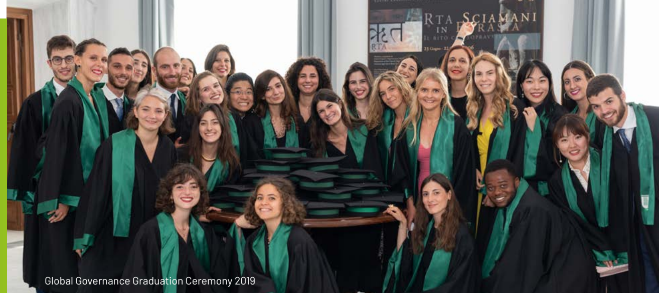
Global Governance Graduation Ceremony 2019